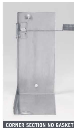
CORNER SECTION NO GASKET