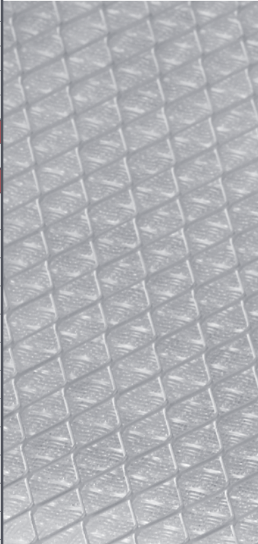
AIR-LAID POLYESTHER CORE